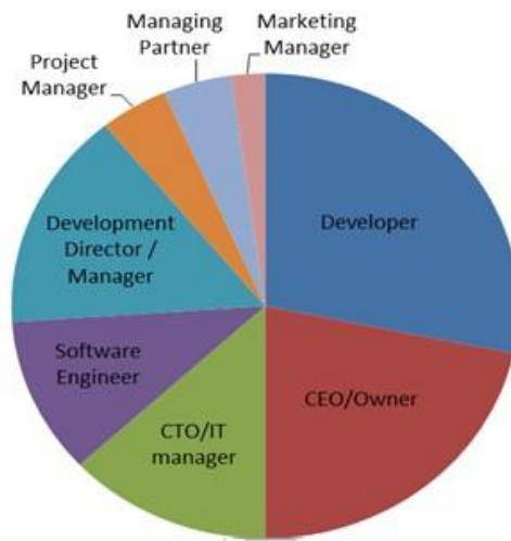
Attendees' Job Titles

"This conference is a great opportunity to meet Kentico and talk about new features that are coming out in future versions of Kentico. The Roadmap is extremely well-diversed and it is great to be involved in that process."